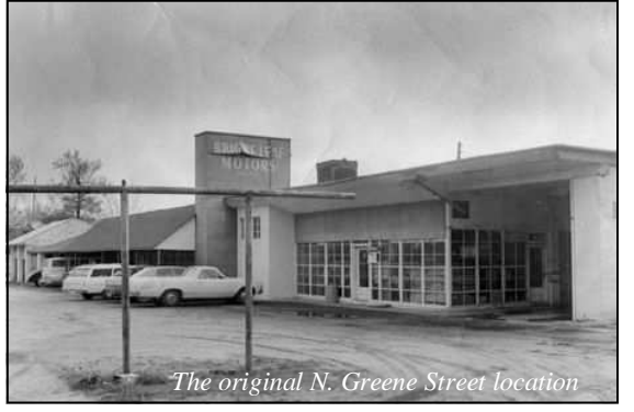
The original N. Greene Street location

Due to growth, ECVC purchased the former TRW building located at 2100 North Greene Street in 2006. After major renovations, the majority of the company moved in September of 2007 leaving battery terminal manufacturing and the Materials Recovery Facility operation on Staton Road.