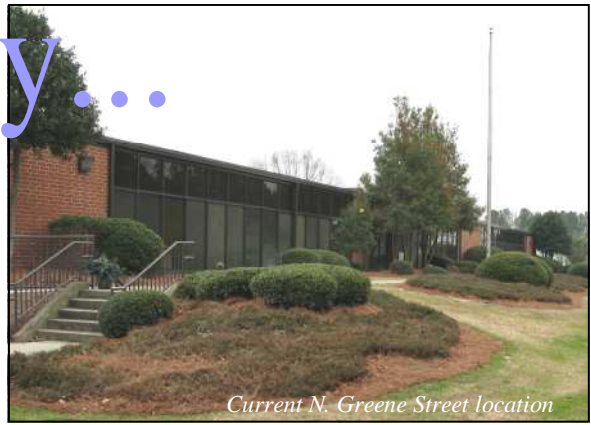
Current N. Greene Street location