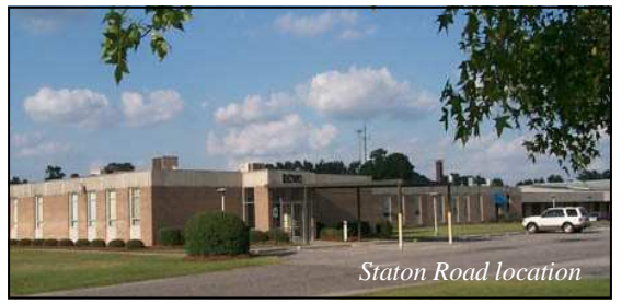
Staton Road location

Due to growth, ECVC purchased the former TRW building located at 2100 North Greene Street in 2006. After major renovations, the majority of the company moved in September of 2007 leaving battery terminal manufacturing and the Materials Recovery Facility operation on Staton Road.